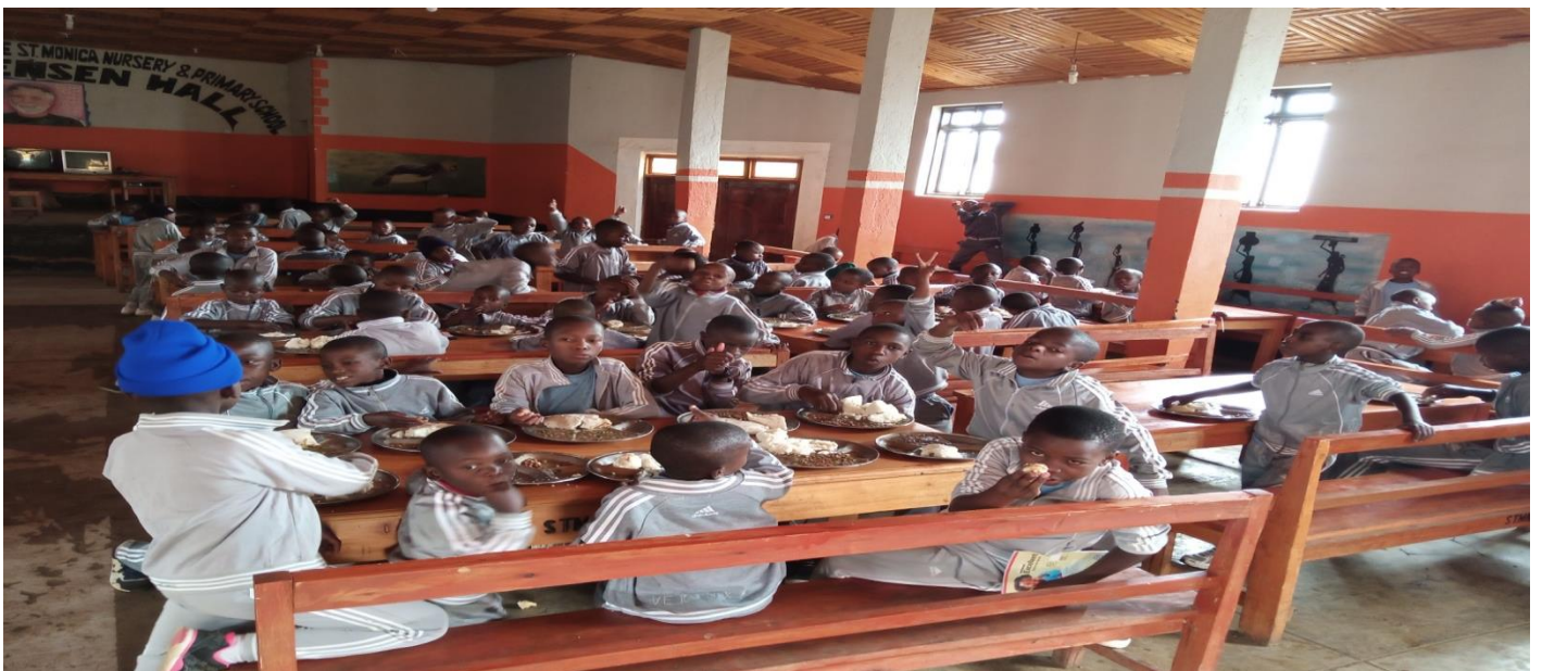
Picture; St. Monica primary school pupils getting lunch in dining hall.