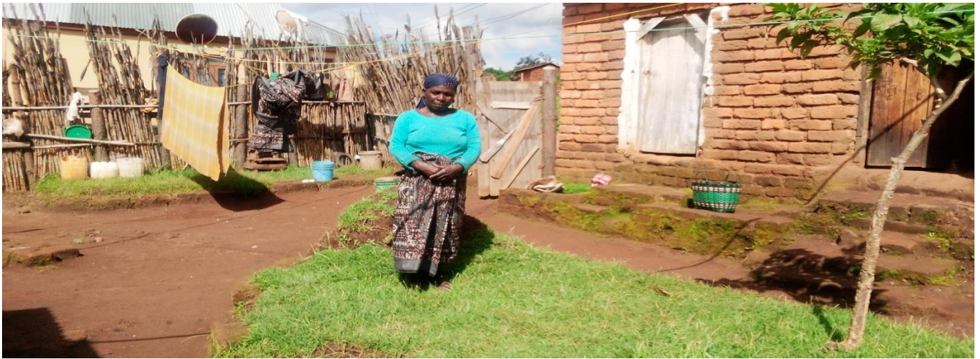
Picture: A widow in her residence.

People at Matamba are very poor. This is due to low level of production forces and technology in production of goods and services. Most of people are indigenous peasants, and substance. This has led to most families fail to pay bills, tuition fee at time. It is this situation that has led the School fail to accommodate its program such as paying wages to workers, having good and enough food for students and purchasing clothes as uniform for them. So your assistance is vital and valuable for the welfare of School and community in large.