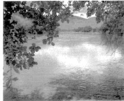
Great Ruaha River close to the farm its water will be used for irrigation.