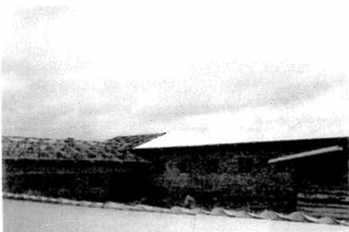
Girls dormitory roofing in progress And now is completed

Your generosity to the poor and helpless children in Matamba, helped me a lot to build St. Monica's Nursery and Primary school as it can be observed from the above pictures. Your donation has made possible to construct five classrooms, administration office and girls dormitory which is in progress.