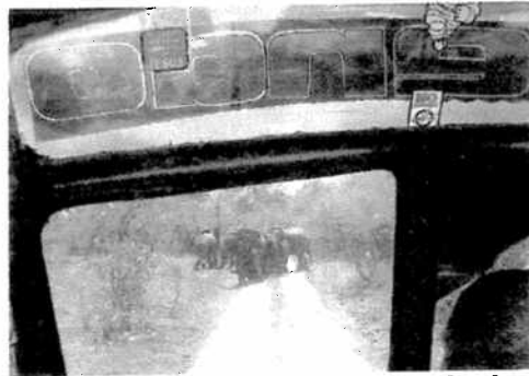
Elephants photo as seen from the bus