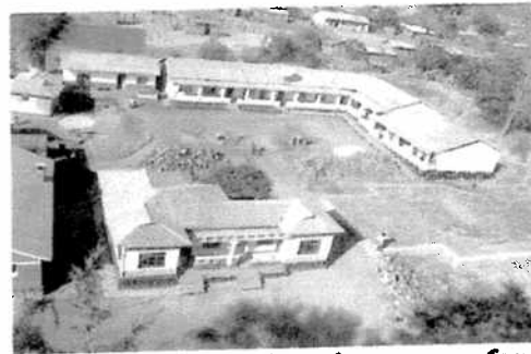
From behind are five classrooms for St. Monica's Primary school and in the Front is an administration office.

Your generosity to the poor and helpless children in Matamba, helped me a lot to build St. Monica's Nursery and Primary school as it can be observed from the above pictures. Your donation has made possible to construct five classrooms, administration office and girls dormitory which is in progress.