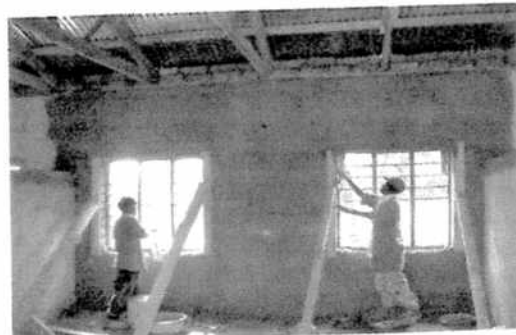
Girls dormitory at plastering stage