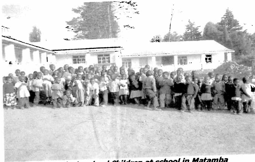
St. Monica's school Children at school in Matamba