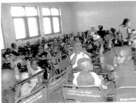
School children having their Lunch at Ruaha head office

We thank very much the two families from New York who kindly sponsored all the costs of the trip which included hiring of the bus, food and refreshments and other entertainments to and from the park.