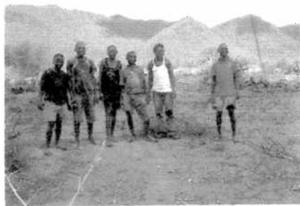
Young Tanzanian's employed To work on the farm.