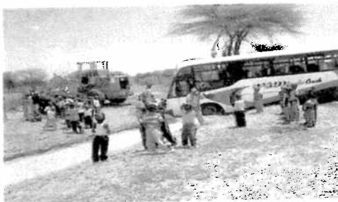
Hired Bus got stuck on the sand river inside Ruaha National Park on the way to see elephants, some school children are outside while waiting for the Bus to get towed by the park wheel loader.