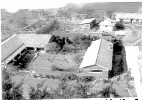
St. Monica Nursery School in the front, And behind is girl's dormitory construction In progress.